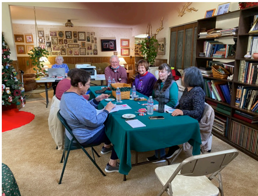
Division 91 Grant Committee hard at work!